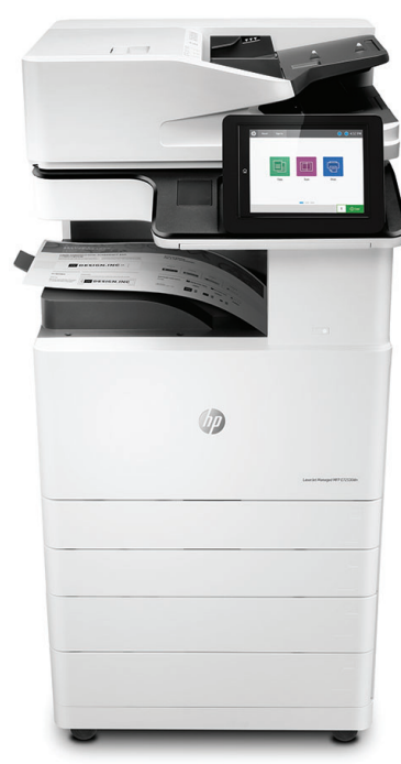
HP LaserJet Managed MFP E72530dn

Businesses that stay ahead don't slow down. It's why HP built the next generation of HP LaserJet MFPs—to power productivity with a streamlined design that delivers premium quality, maximum uptime, and the strongest security.