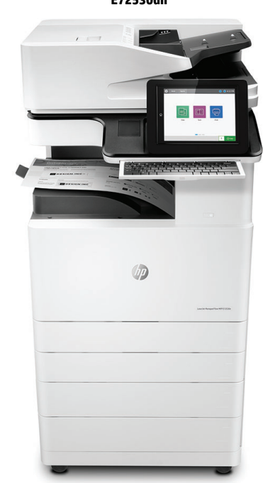
HP LaserJet Managed Flow MFP